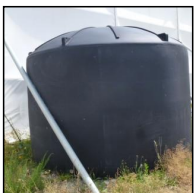
Lot #41 - RX PLASTICS WATER TANK 33,000 LITRE