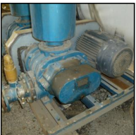
Lot #14 - 2 X VACUUM BLOWERS - TA- FAN