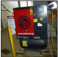
Lot #18 - CP AIR COMPRESSOR / DRIER (ITALY)