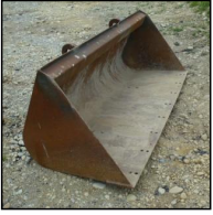
Lot #8 - TELEHANDLER BUCKET TO SUIT JCB/MERLO