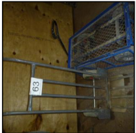
Lot #63 - TROLLEYS X 2