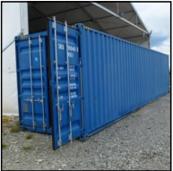
Lot #12 - 40 FT HI CUBE SHIPPING CONTAINER WITH CONTENTS