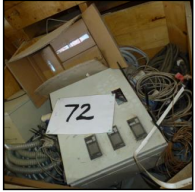
Lot #72 - CRATE OF ASSORTED ELECTRICAL(CABLE/ RELAYS) ETC