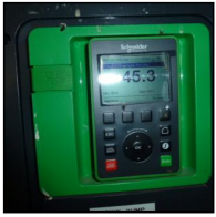
Lot #25 - SCHNEIDER ALTIVAR 650 VSD