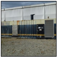
Lot #3 - KOHLER 1600KW STANDBY GENERATOR (EX USA)