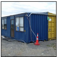
Lot #38 - PORTACOM OFFICE