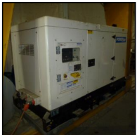
Lot #5 - POWERLINK 30KVA GENERATOR