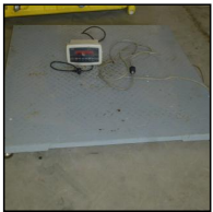
Lot #19 - PLATFORM SCALES WITH WEIGHT INDICATOR