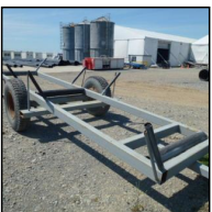
Lot #50 - PIPE ROAD TRAILER DOLLIE