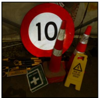
Lot #64 - ROAD CONES/BARRIERS/ SIGNS