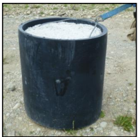
Lot #40 - 4 X ANCHOR WEIGHTS