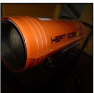
Lot #60 - HEAT BOSS SPARK 45 INDUSTRIAL HEATER