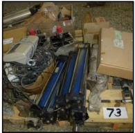
Lot #73 - PALLET OF AIR RAMS / BEARINGS/ LOAD CELL