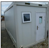
Lot #33 - PORTACOM ACCOMMODATION UNIT