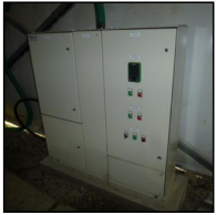
Lot #28 - ELECTRICAL DISTRIBUTION CABINET