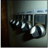
Lot #27 - ELECTRICAL CONTROL CABINET