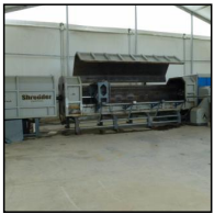
Lot #1 - AVIAN PASG 2000L PLASTIC PIPE REGRIND SHREDDER/ GRANULATOR