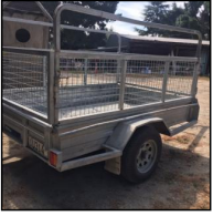
Lot #53 - CAGED TRAILER