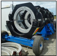
Lot #29 - HDPE PIPE WELDER (1600MM CAPACITY)