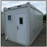
Lot #36 - PORTACOM ACCOMMODATION UNIT