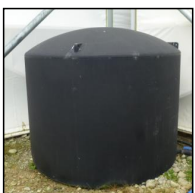
Lot #42 - RX PLASTICS WATER TANK 5,250 LITRE