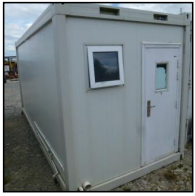
Lot #34 - PORTACOM ACCOMMODATION UNIT