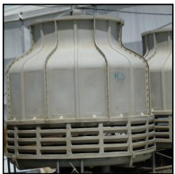
Lot #21 - KS WATER COOLING TOWER