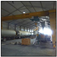
Lot #4 - GOLIATH GANTRY CRANE 8.5 TONNE CAPACITY