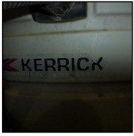
Lot #62 - INDUSTRIAL VACUUM - KERRICK