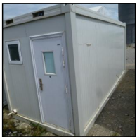
Lot #30 - PORTACOM ACCOMMODATION UNIT