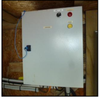
Lot #26 - CONTROL CABINET