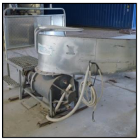
Lot #16 - ROTARY VALVE (CHINESE MFG)