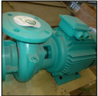
Lot #75 - 3 X NEW WATER PUMP