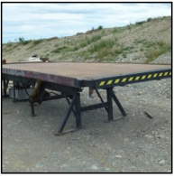
Lot #43 - HYDRAULIC TILT TABLE