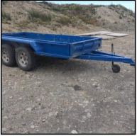
Lot #54 - DOUBLE AXLE TRAILER