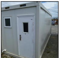
Lot #32 - PORTACOM ACCOMMODATION UNIT