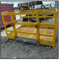
Lot #7 - TELEHANDLER WORK PLATFORM ( MFG KENNEDY ENGINEERING LTD)