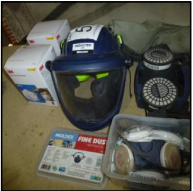
Lot #57 - RESPIRATOR EQUIPMENT- SUNDSTROM ETC