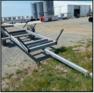
Lot #45 - PIPE ROAD TRAILER DOLLIE