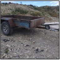
Lot #55 - SINGLE AXLE TRAILER