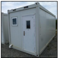
Lot #37 - PORTACOM ACCOMMODATION UNIT