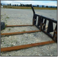
Lot #9 - TELEHANDLER FORKLIFT ATTACHMENT