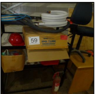
Lot #59 - SHELF WITH ASSORTED SUNDRY GEAR