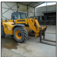
Lot #6 - JCB LOADALL TELEHANDLER