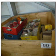
Lot #69 - CRATE OF ASSORTED ELECTRICAL