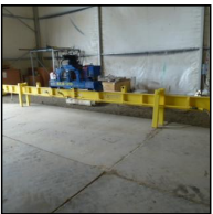
Lot #13 - SCHOENBECK (GERMANY) ECO 12TD VACUUM LIFTER