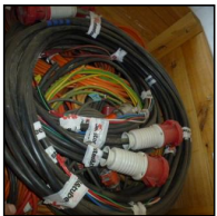
Lot #67 - CRATE OF ASSORTED CABLE AND 2 BOXES OF NEW PLUGS