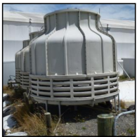
Lot #20 - KS WATER COOLING TOWER