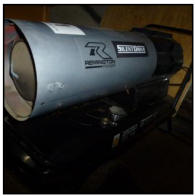
Lot #61 - INDUSTRIAL HEATER- REMINGTON SILENT DRIVE