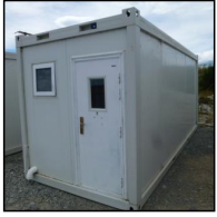
Lot #35 - PORTACOM ACCOMMODATION UNIT