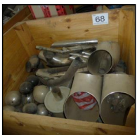
Lot #68 - CRATE OF STAINLESS FITTINGS