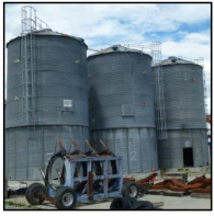
Lot #17 - 3 X GALVANIZED GRAIN SILO'S ( 90T - 100T)