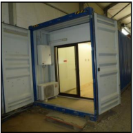
Lot #11 - 40FT HI-CUBE CONTAINER ( EX LABORATORY)