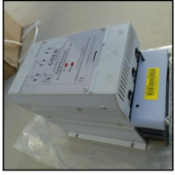
Lot #71 - 3 PHASE SOLID STATE RELAYS X 54 (NEW)