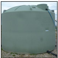
Lot #39 - RX PLASTICS WATER TANK 33,000 LITRE