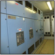
Lot #10 - ELECTRIC DISTRIBUTION CONTROL HUB IN 40 FT CONTAINER