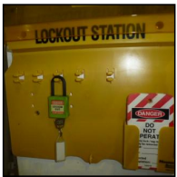
Lot #65 - ELECTRICAL LOCKOUT STATION