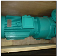
Lot #74 - 3 X WATER PUMP (VACUUM) NEW