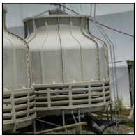
Lot #22 - KS WATER COOLING TOWER