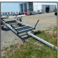
Lot #51 - PIPE ROAD TRAILER DOLLIE