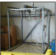
Lot #15 - BULK BAG SUPPORT FRAME WITH AUGER INFEED