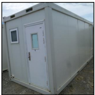
Lot #31 - PORTACOM ACCOMMODATION UNIT