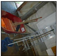
Lot #66 - WHEEL BARROW/LADDER/BROOMS ETC