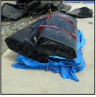
Lot #44 - PALLET LOT OF PVC POOL LINERS