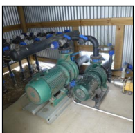
Lot #24 - PUMP SHED COMPLETE WITH 3 X PUMPS & MANIFOLD FILTER SYSTEM