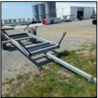
Lot #47 - PIPE ROAD TRAILER DOLLIE