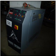
Lot #56 - TOOL TEMP DIE HEATER - SWITZERLAND