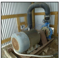
Lot #23 - SAER PUMP (ITALY) WITH 45 KW ELECTRIC MOTOR