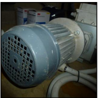
Lot #58 - ELECTRIC MOTOR WITH ATTACHMENT