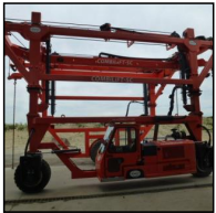
Lot #2 - COMBILIFT CONTAINER STRADDLE CARRIER SWL 35T